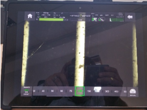
80mm Lens to Object