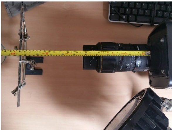
140mm Lens to Object Minimum focal distance