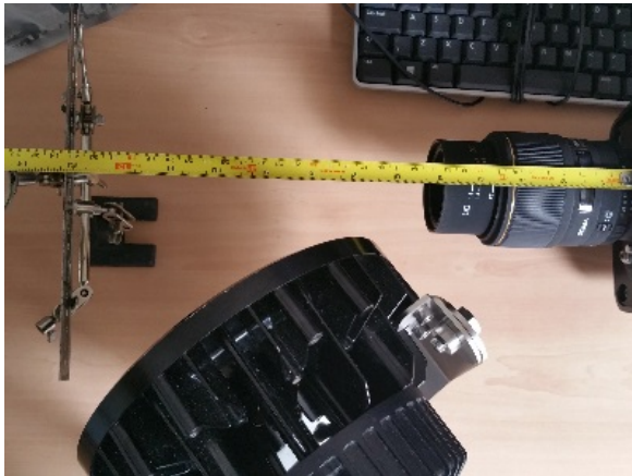
210mm Lens to Object Minimum focal distance