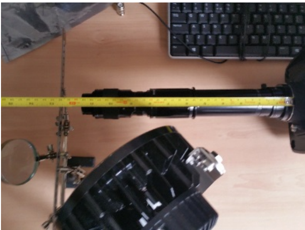
30mm Lens to Object