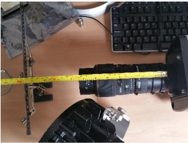
210mm Lens to Object Maximum focal distance