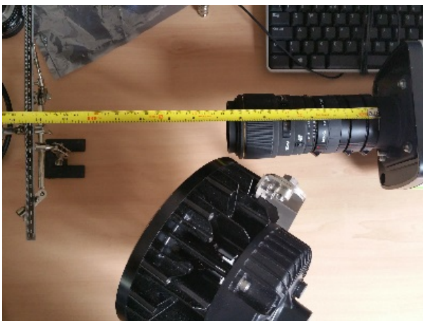
105mm Lens to Object Minimum focal distance